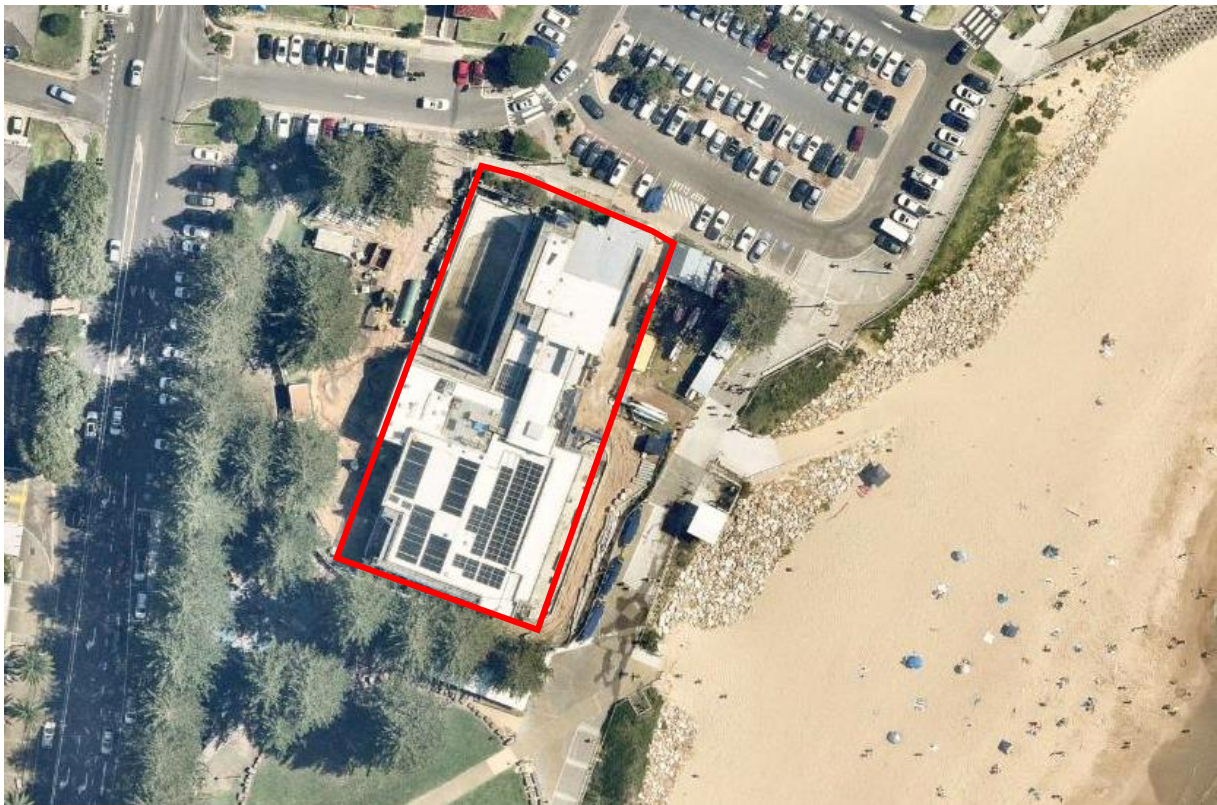
Figure 1: Area subject to reclassification

To achieve the proposed reclassification the following amendment to the SSLEP2015 is required.